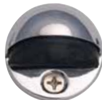
V1080 Door Stop 38mm