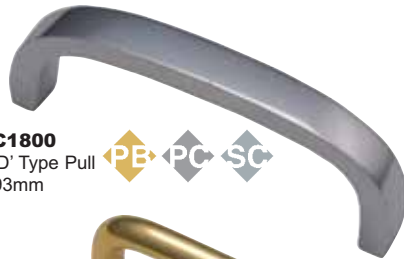
C1800 'D' Type Pull 93mm