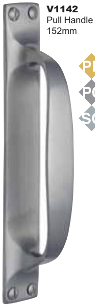
V1142 Pull Handle 152mm