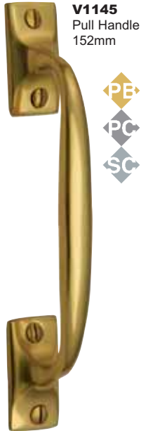
V1145 Pull Handle 152mm