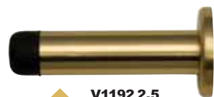
V1192 2.5 Projection Door Stop Projection: 2 1/2" (64mm)