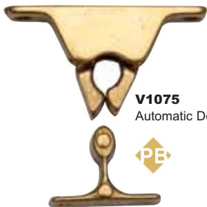
V1075 Automatic Door Catch