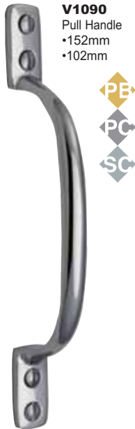
V1090 Pull Handle •152mm •102mm