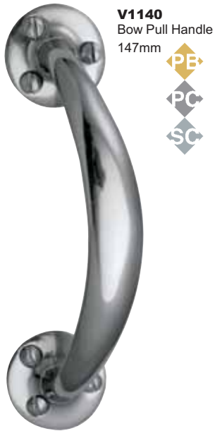
V1140 Bow Pull Handle 147mm