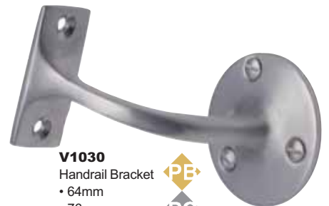
V1030 Handrail Bracket • 64mm • 76mm